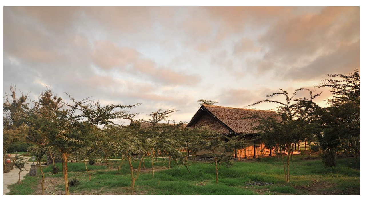
3 nights at Sweetwaters Serena Camp (all meals included)

56 stylishly appointed tents dot the landscape and are designed with charming thatched roofs, solid floors and canvas interiors. All tents feature electricity, an ensuite bathrooms with hot and cold water, showers and flushing toilets.