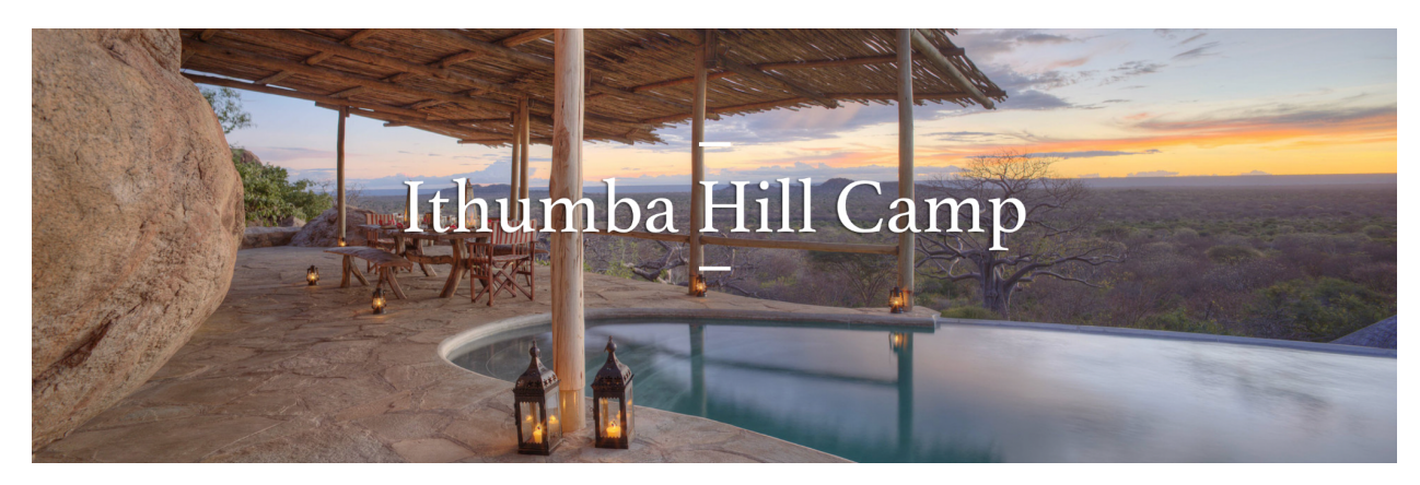
3 nights at Ithumba Hill Camp (all meals included)