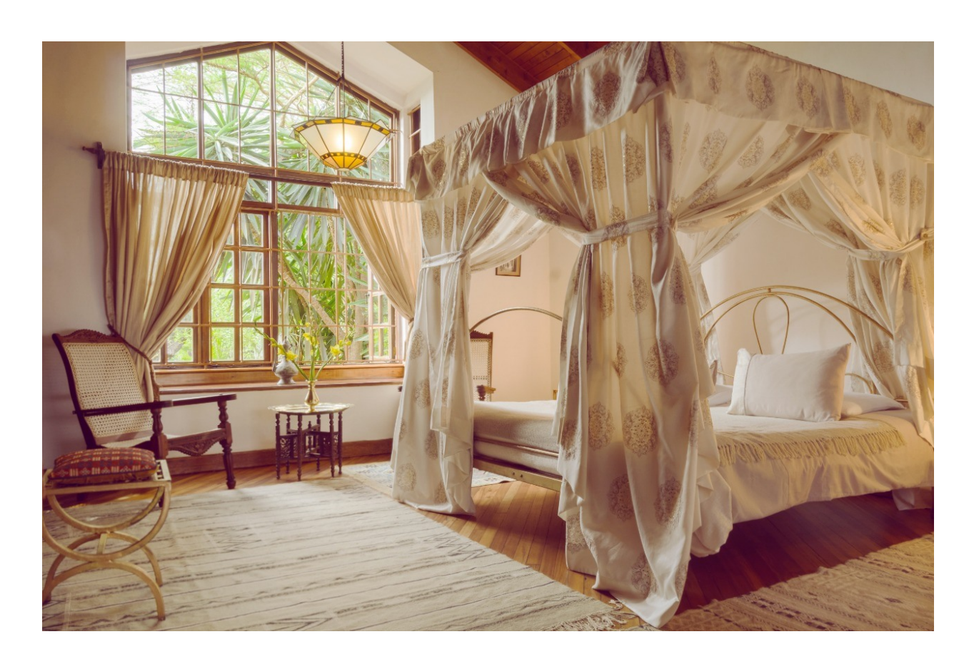
2 nights at Macushla House (breakfast included)

Enjoy a gin and tonic in the bar, or select a book from the well-stocked library to enjoy over afternoon tea and biscuits on the covered veranda. Hearty breakfasts and fine dinners are prepared from fresh local ingredients, with breakfast, half- or full-board options.